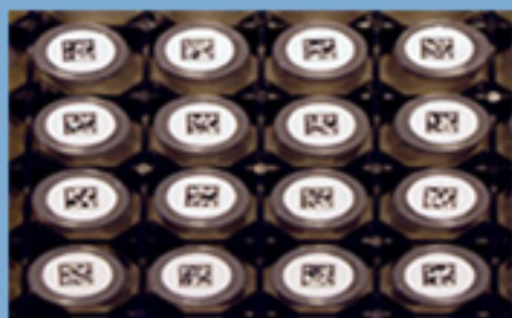
96 well format 2D matrix bar codes